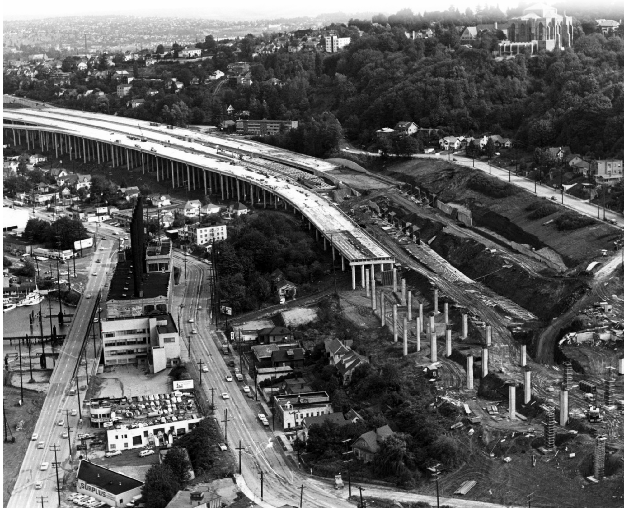
I-5 CONSTRUCTION AT LAKEVIEW BLVD - 1962

The construction of Interstate 5 in the mid-1960s dramatically transformed the landscape of Seattle, segregating two halves of the city. Our team imagines the urban fabric restitched from Olive Way to just beyond Thomas Street. Using geological landforms as inspiration, we see the lid reconnecting the Capitol Hill, Cascade and Downtown neighborhoods while providing much needed affordable housing and recreation space for downtown residents.