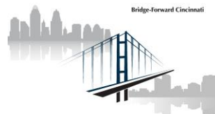
Bridge Forward Cincinnati Cincinnati, OH