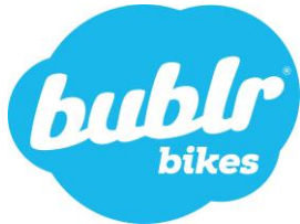
Bublr Bikes Milwaukee, WI