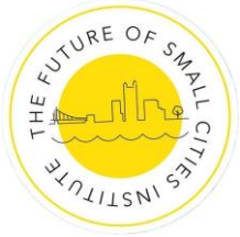
The Future of Small Cities Institute Troy, NY