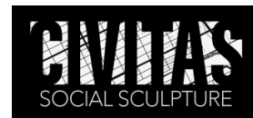
CIVITAS.design Erie, PA