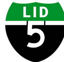
Lid I-5 Seattle, WA