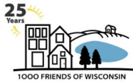
1000 Friends of Wisconsin Madison, WI