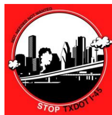
Stop TxDOT I-45 Houston, TX