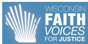
Wisconsin Faith Voices for Justice Madison, WI