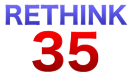
Rethink35 Austin, TX