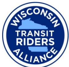
Wisconsin Transit Riders Alliance Madison, WI